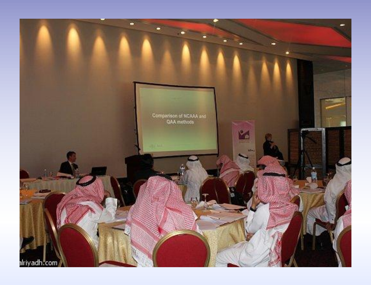
Reviewer training run by the UK Quality Assurance Agency